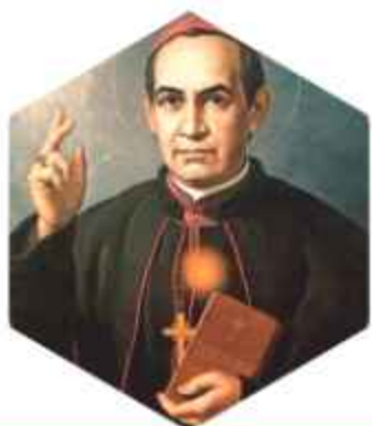
St. Anthony Mary Claret Our Founder & Patron