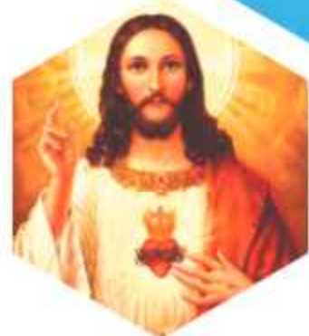
Jesus Christ Our Master