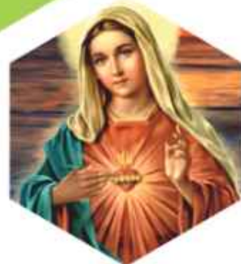
Mother Mary Our Inspiration